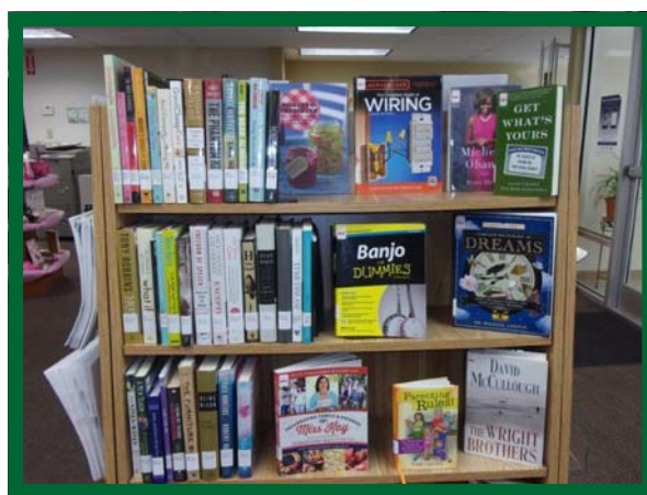
Donations for Materials

Lee County Public Library in Pennington Gap received a new central HVAC system thanks to additional governmental support provided by the Lee County Board of Supervisors.